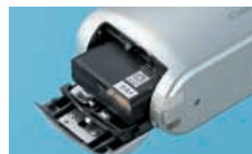
rechargeable lithium-ion battery

The Caplio G3 gives you the choice of three ways to power the unit: an optional rechargeable lithium-ion battery, AC adapter, or the convenience of two AA alkaline or nickel metal hydride batteries. This flexibility is perfect for those regularly on the road.