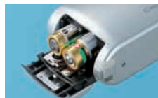
regular AA batteries (alkaline/Ni/NiMH)