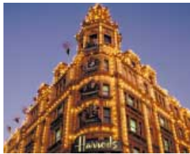
Long Exposure Mode

Capture Images with Brilliant Versatility Take superb digital pictures with the Caplio RR120. Its high-resolution 2.2 megapixel CCD, 6x zoom, impressive 8-cm macros and strong built-in flash provide a fantastic range of shooting possibilities.