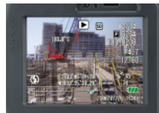
Photo is simulated. Actual appearance may differ.

Please visit the Ricoh website www.ricoh.com for a list of compatible Bluetooth ® -equipped GPS devices.