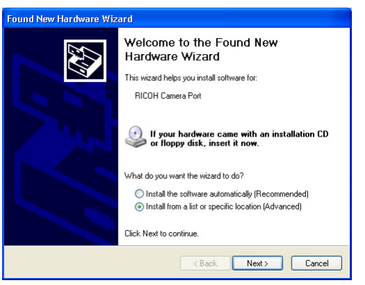
Figure 1: Found New Hardware wizard